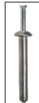
Zinc Nailon™ Mushroom

Friendly, courteous delivery! Ship UPS same day!